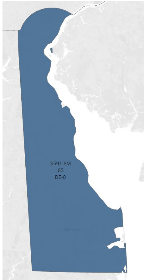
Exact Congressional District and investment amounts not known for all companies.

Number of Companies Receiving Venture Funding in 2020, Amount Invested by Congressional District