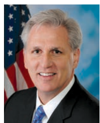
Rep. Kevin McCarthy

House Majority Leader Kevin McCarthy has been a champion of issues impacting venture capital and the entrepreneurial ecosystem through his many years in Congress and in Republican leadership. From tax reform to immigration to tech policy, Majority Leader McCarthy will discuss a wide range of issues important to the ecosystem and provide an update on what he sees around the corner on some of our most pressing issues.