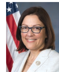
Rep. Suzan DelBene

Congresswoman DelBene will discuss innovation policy and the unique perspective her over two decades of experience as a successful technology entrepreneur and business leader brings to the House and to her position on the influential House Ways and Means Committee.