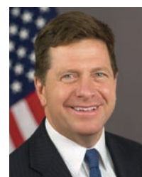
Chairman Jay Clayton