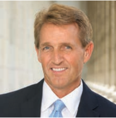
Senator Jeff Flake

Through his over fifteen years of public service first in the U.S. House of Representatives and now in the U.S. Senate, Senator Flake has developed a keen interest in the startup community and a deep appreciation for the contributions of immigrant founders to the U.S. economy. Senator Flake will share with us the details of his legislation to create a startup visa for immigrant founders and provide us with updates on other key policy matters he is working on as a member of the Senate Judiciary Committee and as Chairman of the Subcommittee on Privacy, Technology and the Law.