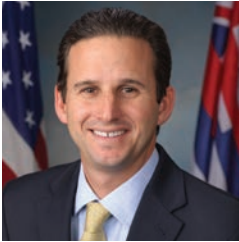
Senator Brian Schatz

As the senior senator from Hawaii and member of the Senate Democrat's leadership team, Senator Schatz is active on a number of issues impacting the entrepreneurial ecosystem, including as a member of the Banking Committee and as Ranking Member of the Senate Commerce Committee's Subcommittee on Communications, Technology, Innovation, and the Internet. During his keynote address, Senator Schatz will update us on the latest policy deliberations playing out on Capitol Hill and their impact on venture capital and startups.