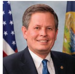
Senator Steve Daines

Join us for a reception on Capitol Hill featuring Senator Steve Daines (R-MT), honorary co-host and former venture-backed entrepreneur.